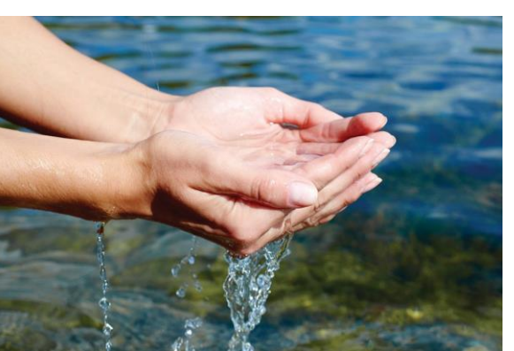
Ohio EPA Division of Environmental and Financial Assistance

To benefit Ohio's water resources and public health through low cost financing, economic incentives, and project assistance to public and private organizations and individuals.